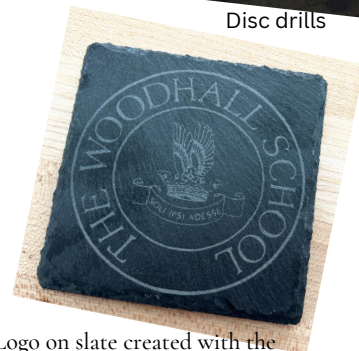
Logo on slate created with the Glow Forge Lazer Cutter