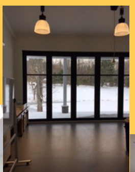
S.T.E.A.M Lab and Classrooms

Students and families were greeted with many tangible changes and improvements to the campus upon their return to school, as well as throughout the fall term, starting with the new STEAM (Science, Technology, Engineering, Arts and Mathematics) Lab, and the fully renovated classroom spaces in Founders Hall.