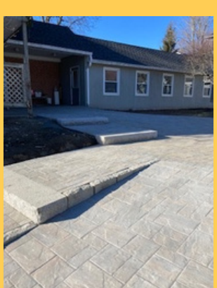
New walkways in the school's main courtyard